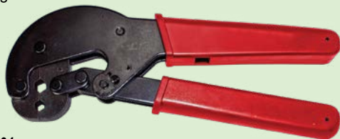
Item No. WTCXC-03634